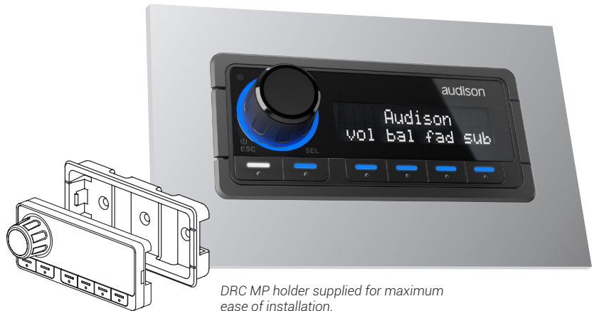
DRC MP holder supplied for maximum ease of installation.